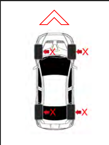
FOUR WHEEL DRIVE